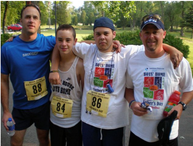
Staff and boys competed in our annual Run/Walk event in June.