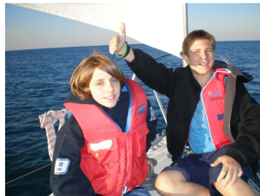
The boys always enjoy the annual sailing night hosted by Sarnia Yacht Club.