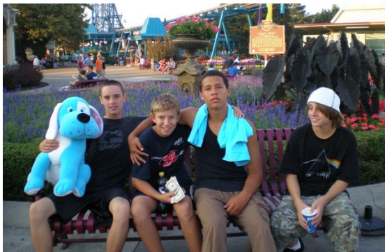
The boys had great fun on a day trip to Cedar Point to finish out the summer.

For information on how you can leave a legacy, call 519-381-3776 or visit www.leavealegacy.net .