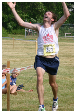
Left: Crossing the finish line. Below: SCITS - one of our school teams