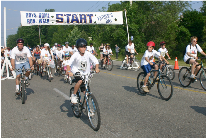
And they're off!