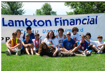
Boys and staff relax after the run.