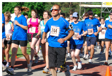
The new tech shirts were a hit with runners!