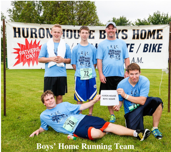
Boys' Home Running Team

If you haven't been to our event-dedicated website, we encourage you visit www.boyshomerun.ca . Among other things, you can find photos, including family and team photos, and race results there. We also took baby steps into Twitter and Facebook this year, and we expect electronic communications will grow again in 2014.