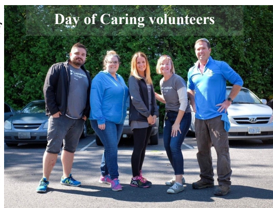
Day of Caring volunteers

Inside and outside, maintenance done this fall was appreciated. During the United Way Day of Caring in September, volunteers from Imperial Oil, Suncor, and the Lambton College Alumni Association did a wonderful job of painting the hallways and the upstairs living space (in a colour chosen by the boys).