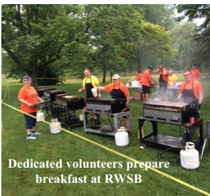
Dedicated volunteers prepare breakfast at RWSB

Volunteers have been at the heart of Huron House Boys' Home since the very beginning. Although we have many wonderful, dedicated Run/Walk/Skate/Bike volunteers, we are currently looking for people to join the RWSB committee. If interested, please contact Andrew Shaw at ashaw@hhbh.ca .